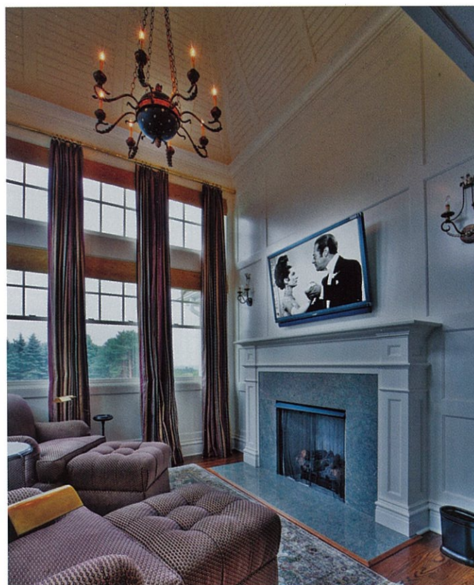
Outstanding ceiling features include a hand painted domed ceiling in the rotunda, and this beadboard tent ceiling in the master bedroom.