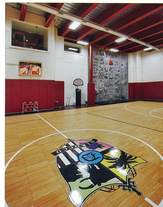
Basketball court at right features corrugated steel ceiling, padded walls, climbing wall, scoreboard and family crest.