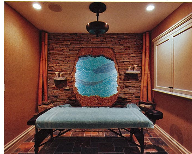
Massage room with dramatic soothing waterfall of backlit colored glass tiles.