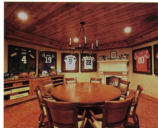
Sports memorabilia room

The lower level of the home includes a home theater with tiered seating and a ceiling that twinkles in the dark; a wine tasting room and wine cellar. Pictured is one of the incredible lower level sports memorabilia rooms with displays that include boxing gloves and sneakers of sports legends. COUNTRY CLUB HOMES won three SPECIAL FOCUS awards for other unique rooms in this exceptional home, including a 50's diner, which is part of a suite for teenagers, a massage room and striking adjacent steam shower with crystal light niche, and a 30 ft. high full court basketball court. The court was built underground and cost $1.5 million.